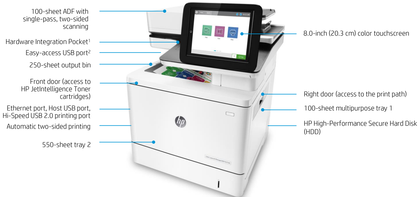
HP Color LaserJet Managed Flow MFP E57540dn