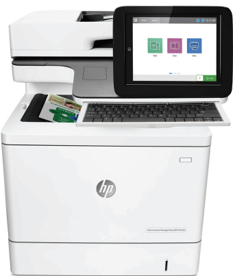
HP Color LaserJet Managed Flow MFP E57540c