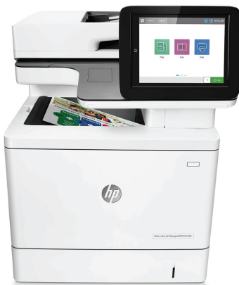
HP Color LaserJet Managed MFP E57540dn

Ideal for enterprises and medium businesses that need a secure, highly productive, energy-efficient color MFP.