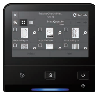
5-inch colour touch panel

When using Private Charge Print, you can easily select and delete the documents viewing the thumbnails shown on the panel. Convenient for saving time and waste.